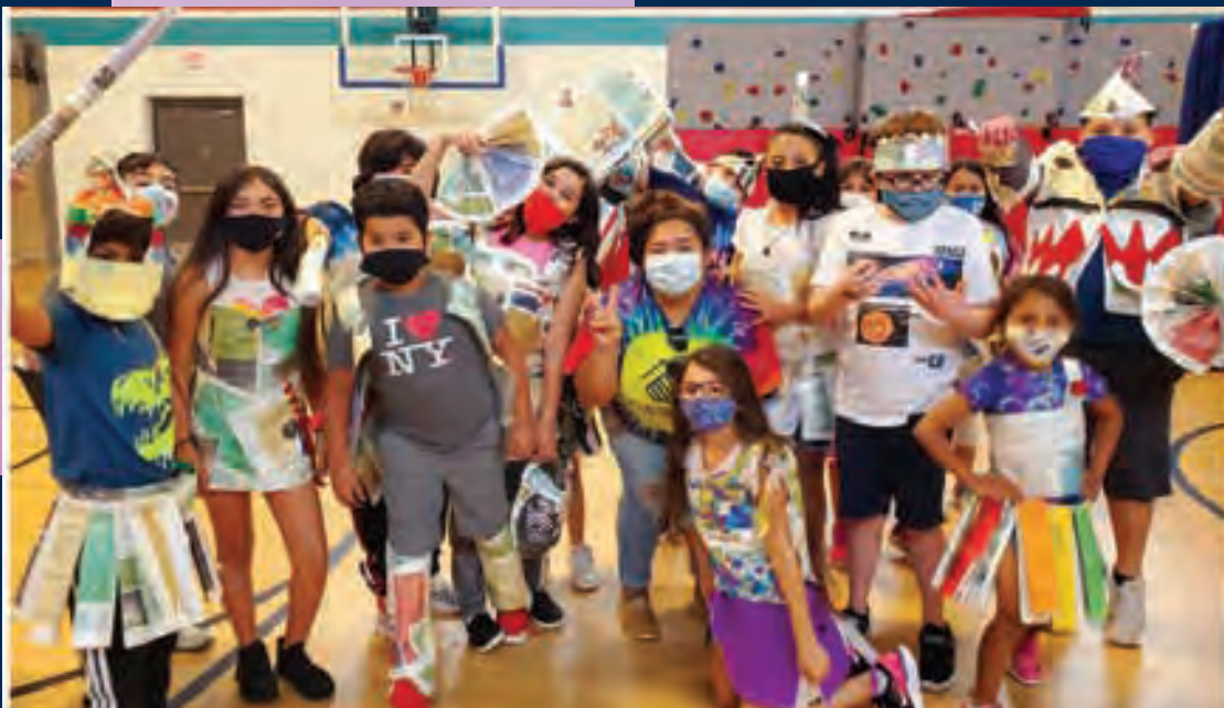
Fashion Show at the Main Unit! Members were able to participate in a positive and empowering fashion show where they created their own design made with newspaper