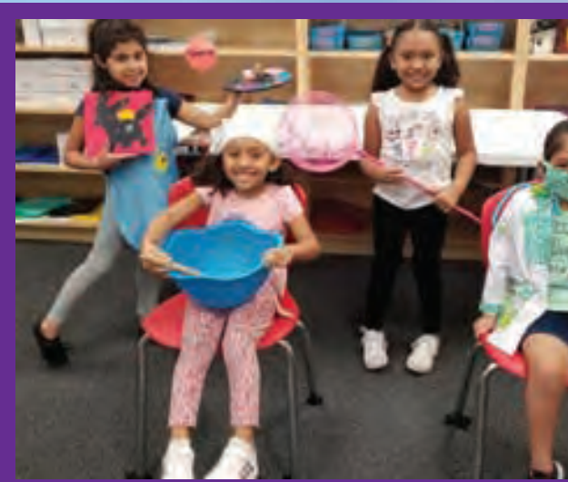
Career day at San Juan! Mem so much fun dressing up to e their dream careers and g