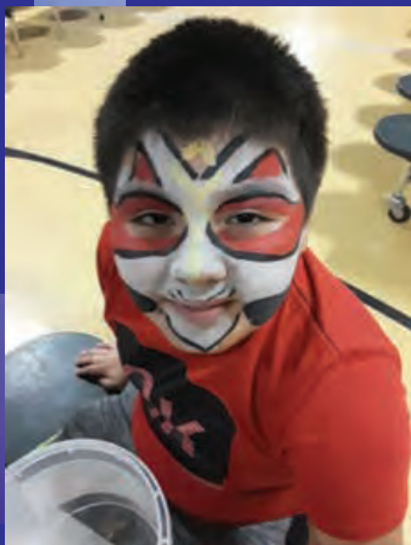
Carnival Day at South Pharr! The SP team made a carnival themed day for members to safely enjoy in the gym with delicious treats and face painting!