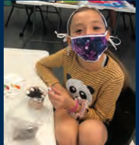
Dirt Cup Day! Members and staff made their own sweet treats!