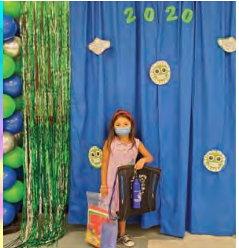
End of Summer Swag Bag!