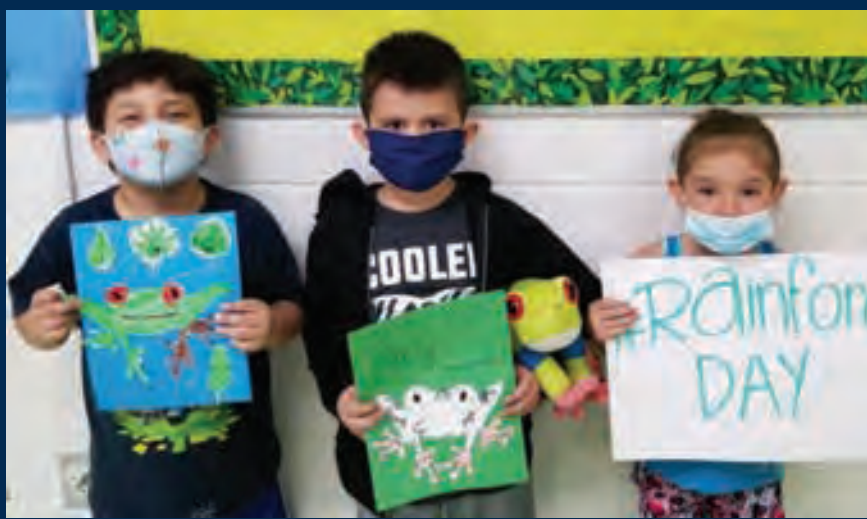
Rainforest Day ! Members learned all about the rainforest and how to preserve it!

Some days at the club this Summer were extra special! Thank you to